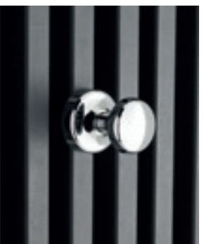
Magnetic Robe Hook Holds up to 3kg weight ACC001 Chrome £58.00