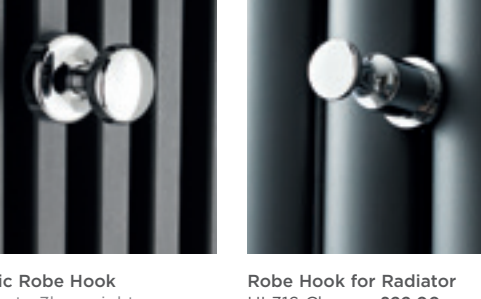
HL316 Chrome £22.00