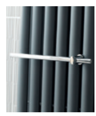
Towel Rail for Radiator HL318 Chrome £96.00