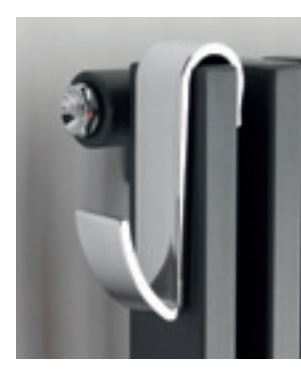
Radiator Hook ACC002 £32.00