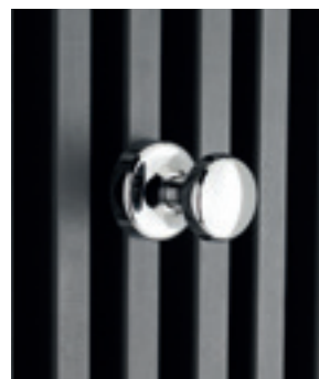
Magnetic Robe Hook Holds up to 3kg weight ACC001 Chrome £52.00