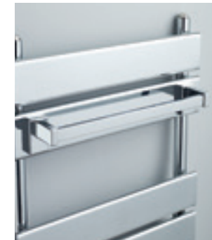
Magnetic Towel Rail ACC005 £130.00