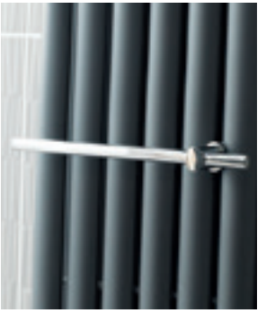
Towel Rail for Radiator HL318 Chrome £87.00