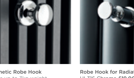
Robe Hook for Radiator HL316 Chrome £19.00