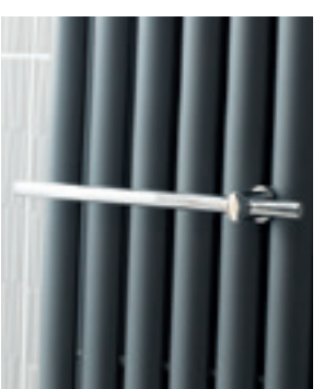
Towel Rail for Radiator HL318 Chrome £82.00