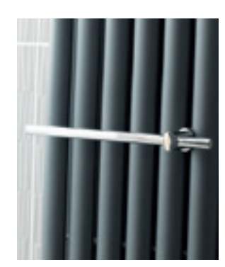
Towel Rail for Radiator HL318 Chrome £74.00