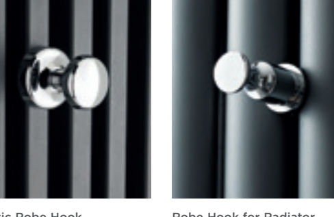
Robe Hook for Radiator HL316 Chrome £17.00