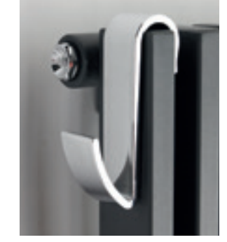
Radiator Hook ACC002 £25.00